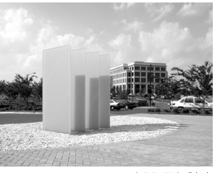
Levitation , 2006; installed at the Whitehall Corporate Center, Charlotte, NC