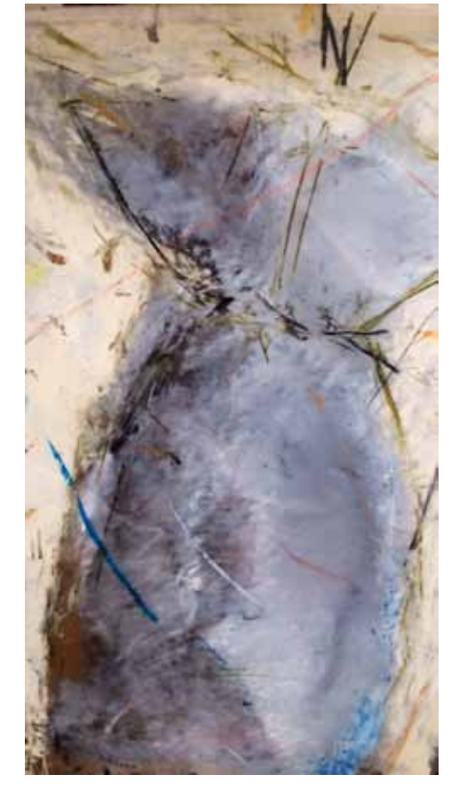
Fish , 1989, mixed media on Mylar, one of four panels: each 80 x 40 in. (203.2 x 101.6 cm)