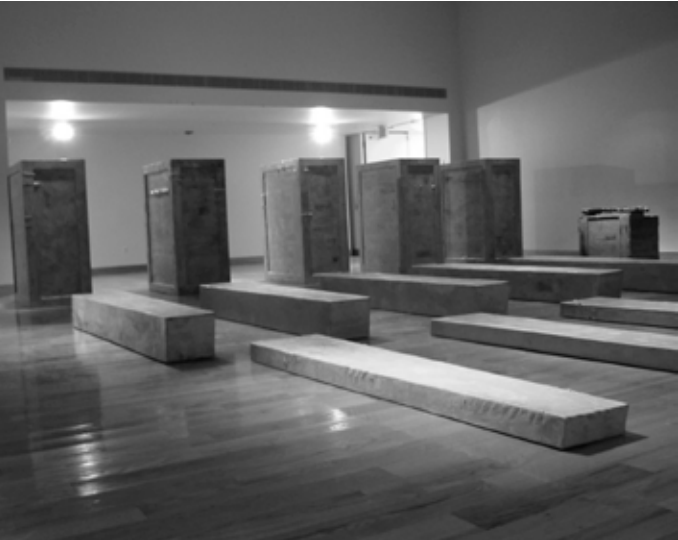
View of Sex Death Offerings/Transfiguration , 2002; a site-specific installation at the University of Wyoming Art Museum, Laramie, WY

Kraus produced several major works in India that are key to his "Roman Wedding" series. The large marble Bed (2011-13) features on its legs highly sexualized cartoon imagery. In preparation for this work, he created a suite of studies: ink-line drawings on silk, collectively titled "Until the End of Time." The cartoonish "Humpty-Dumpty" figures he uses in the drawings hark back to his early days as an illustrator of children's books. Black Bench/Altar (2007), a large interactive piece, can actually be used as a bench—although, made of marble and inlaid with semi-precious stones, it is definitely not of the standard park-bench variety.