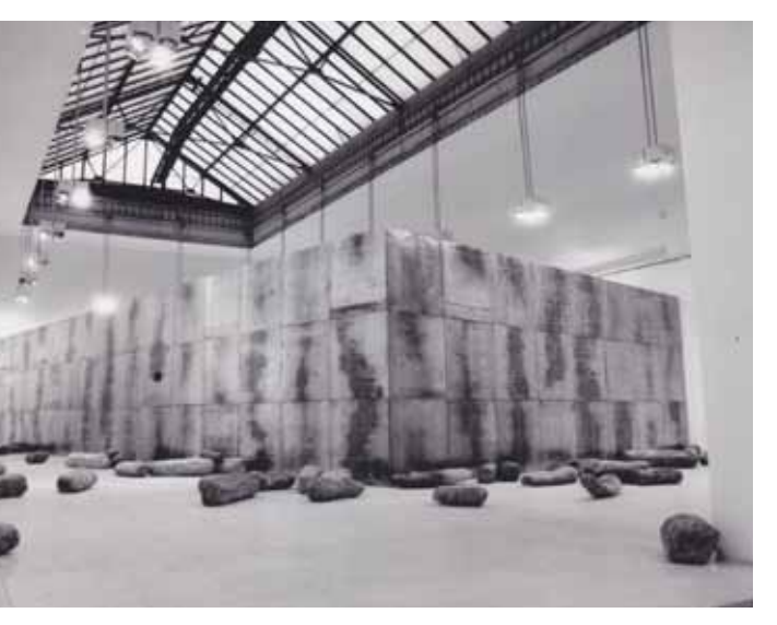
Installation view of the Sex Death Offerings exhibition at the Konsthall Manes, Prague, 1999

Over the years, Kraus's work grew increasingly labor-intensive and obsessive, featuring monochrome surfaces made of countless layers of wax and pigment. Three Beeswax Offerings (1994-97), No Trade (1998), and Enclosures (1998) are striking examples of the "Sex Death Offerings" series. Heavy Distance (1996), a wall-hung sculpture made of white marble completely covered in malleable lead sheeting and painted in monochrome blue-green